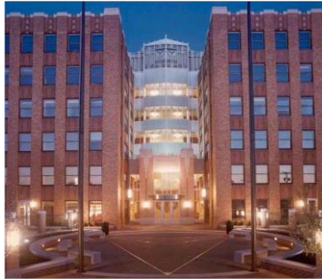
The Roanoke Higher Education Center